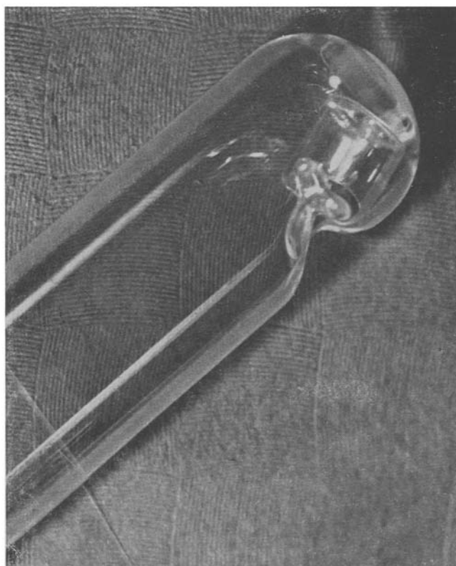
FIG. 2. Glass vial held in isomerization tube.

The isomerization tube can be modified by inserting three long indentations near the bottom of the tube (Figure 1); these indentations extend toward the center of the tube at a slight angle. The clearance between the tips of the indentations and the inner wall of the tube should just be wide enough to allow a glass